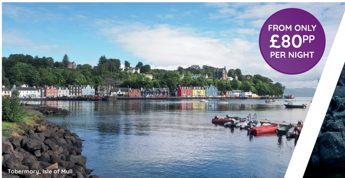
Tobermory, Isle of Mull