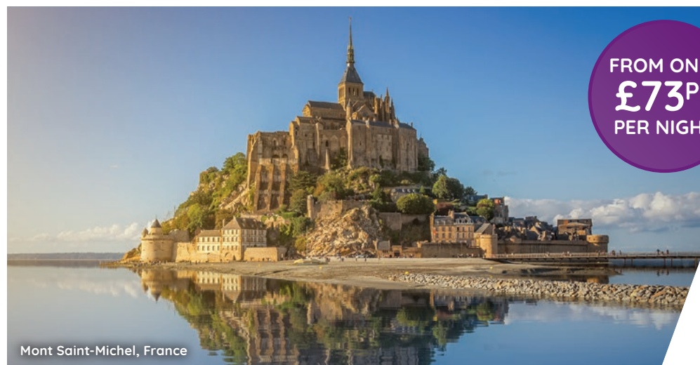
Mont Saint-Michel, France