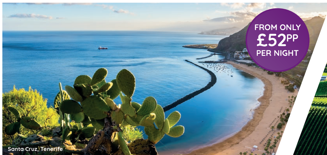
Santa Cruz, Tenerife